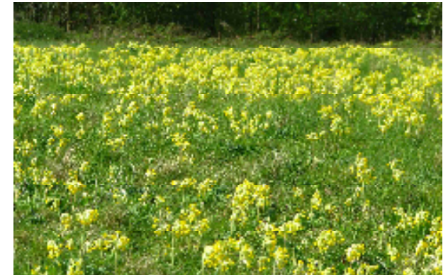
Cowslips, Tumulus area of Old Down late April