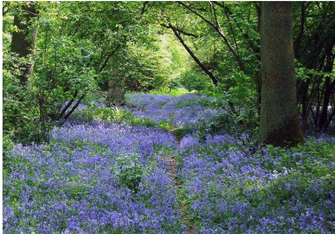
The main ride in Cowdown 1 st May 2011

What an amazing spring! April 2011 was the hottest on record with practically no rain at all. Our newly restored rides and glades were overwhelmed with the scent and colour of bluebells. Insects and wild flowers thrived in the brilliant sunshine. Here are just a few images from our glorious copses: