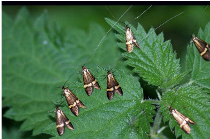
Can you identify these extraordinary insects?