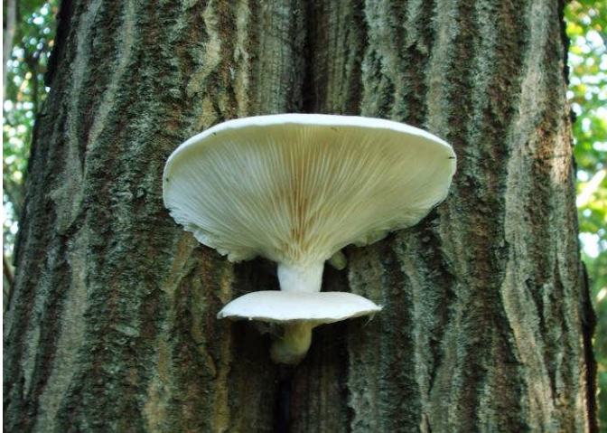
Delicious or deadly? Cowdown Copse 2010

The problem is that most of us have no idea which mushrooms are edible and which are not.