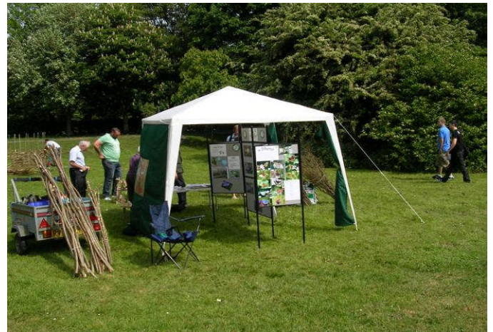
The OWG display in Eastrop Park 7 th May 2011

This year the HWWT celebrated their 50 th Anniversary with a series of events across the county. We were delighted to take part in the Basingstoke event by putting on a display in Eastrop Park on the 7 th May.