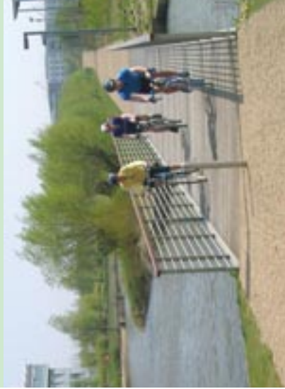
Green Park, Reading