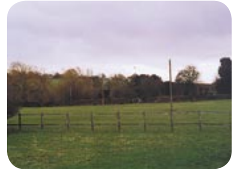
View across Archery Field towards the St Mary's Church

The tree cover in the Conservation Area is predominantly broad-leaved in character, with a diverse range of species present. Ash and beech are dominant with a number of crack willows, particularly around the old watercress beds in Frog Lane. Other species represented include birch, walnut, holly, field maple, sycamore, lime, poplar and oak. A few conifers are scattered about the Conservation Area such as yew and black pine. There are some good examples of willows, in the Conservation Area. These include a group of maturing weeping willows by the track to the church, and a pair of fine mature crack willows just off Frog Lane.