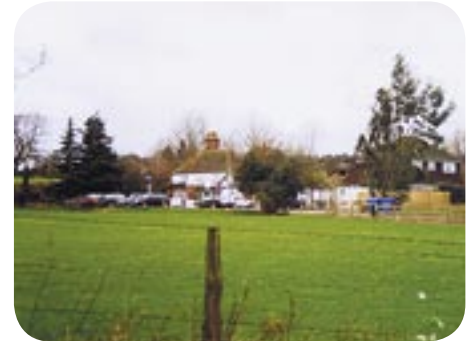
View of the Gamekeeper's Public House

The village remains residential in character with some existing industrial uses, primarily storage yards, along Frog Lane, near the former canal. Residential plots lie along the three main roads in the area and are generally large and of irregular shape and orientation. However, the prominence of key farm complexes and manors - Manor Farm, The Farm, Mapledurwell House and Gray's Farm is important. It establishes the overriding rural and agricultural character and hence the appearance of the village. Also important are the many water courses and ponds in the village.