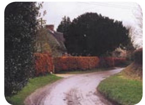
View along Tunworth Road