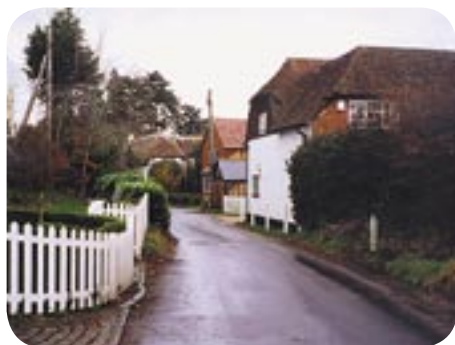
View north-west along The Street