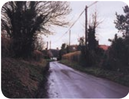
Rye Cottage from the south

'The Street' has a strong character created by its topography, the bends in the road and the presence of a number of important Grade II listed buildings, which punctuate the streetscene. There is a dynamic quality to this character, as the arrangement of buildings changes when viewed from different angles, descending and ascending the road.