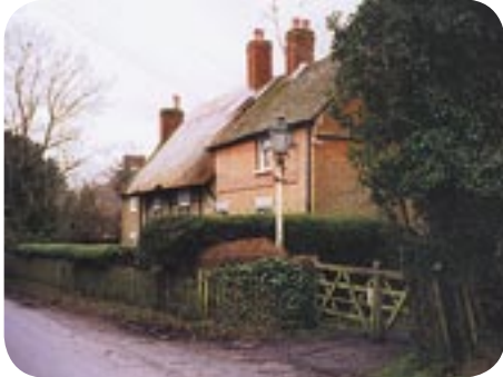
Little Common Cottages