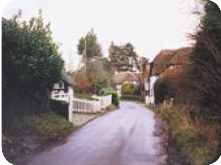
View north along The Street