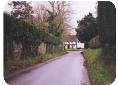
View along Tunworth Road

Manor Farmhouse dates from the late 18th century and has a double-fronted brick elevation and old tile, hipped roof. The building dominates the open space opposite on Tunworth Road, and can be glimpsed through the trees from the lane. The former outbuildings to the immediate north of the farmhouse have been much altered, and their relationship is no longer a defining characteristic of the area. However, the outbuilding to the south is complimentary to the setting of the house in glimpses from the lane.