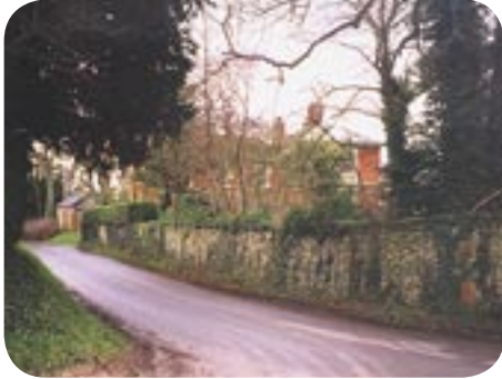
Mapledurwell House and boundary wall