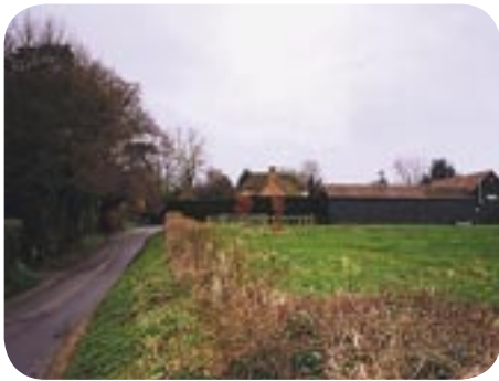
The Farm from outside the Conservation Area

The many watercourses and ponds that permeate the Conservation Area, at different times of the year are of special and distinctive interest. In addition to the pond in the centre of the village, there are other smaller ponds near the church and at the foot of the hill, on the western edge of the area. The watercourses joining these features are also prominent, particularly along Frog Lane.