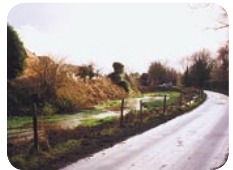
View along Frog Lane, including Little Common Cottages