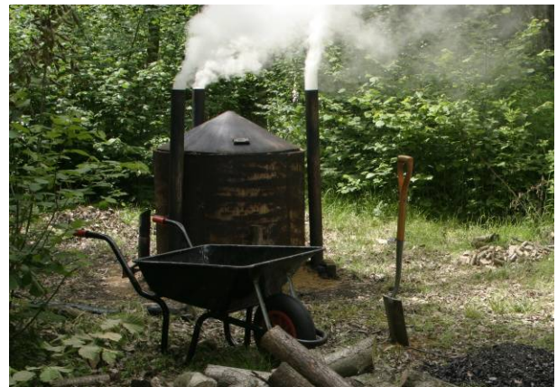
Charcoal burning in Cowdown Copse