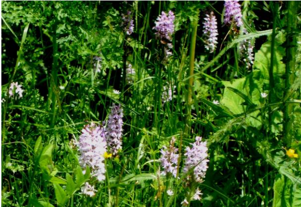
Common Spotted Orchids