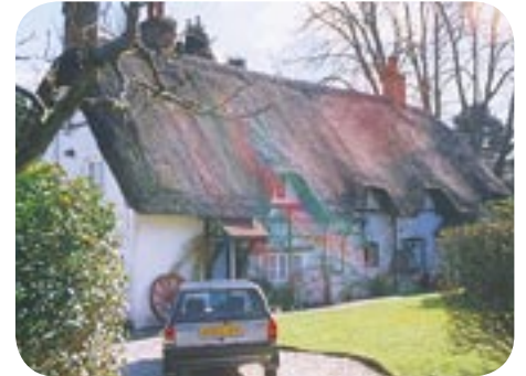
Queen's Meadow Cottage, Salters Heath Road

The population of the Conservation Area in 1998 was approximately 98 (projection based on the Hampshire County Council Planning Department Small Area Population Forecasts 1995).