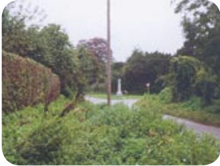
The War Memorial