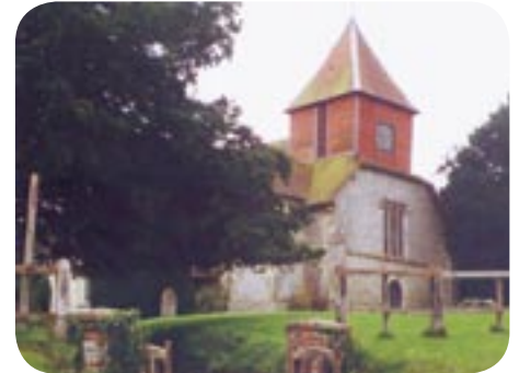
All Saints' Church

All Saints' Church dates from between the 10th and 14th centuries with minor restoration work in 1851 and 1887. It is constructed of flint, some of which is laid in a 'herring-bone' pattern, and has a clay tile roof with a tile hung bell-turret. The church lies at the top of a small hill, and this feature can, therefore, be seen from across the fields to the west of the church. The main body of the church, however, can only be seen at close range, as it is well screened behind the trees and hedges of the narrow rural lane that leads up from the main village.