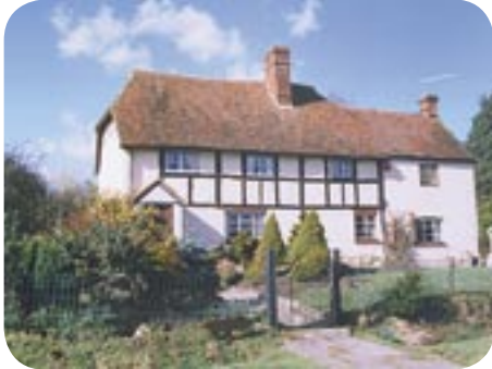
Wantage Cottage on Salters Heath Road