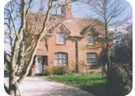
13 and 14 Queen's Cottages, Ramsdell Road

A further AAP within the Conservation Area surrounds the building lines on each side of the road extending northwards. Occupation of this area never appears to have been intense and the houses are all irregularly spaced. Further investigation into the age of the buildings would enhance the understanding of the development of the village. A 'keyhole enclosure' is located to the south-east of Field Barn Farm (just south-west of the Conservation Area) and this has been recognised as a Scheduled Ancient Monument (SAM).