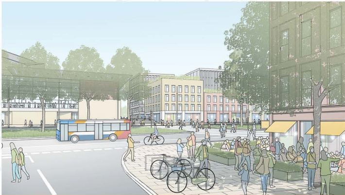
Options for the transformation of Churchill Way