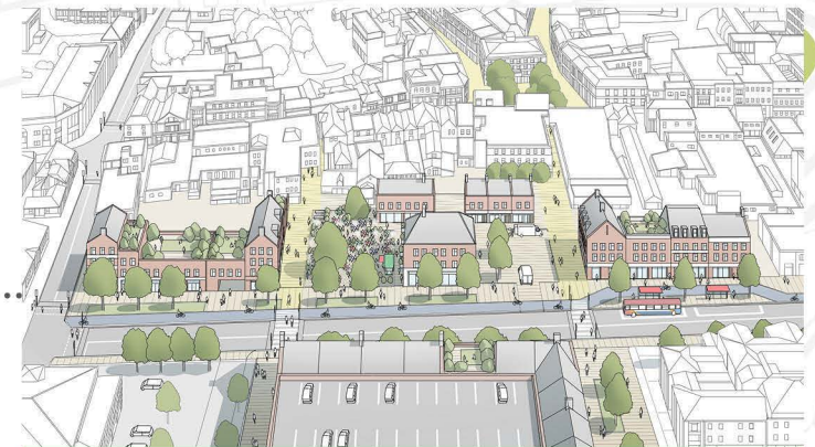
Potential for car park improvements and infill development in the Top of Town