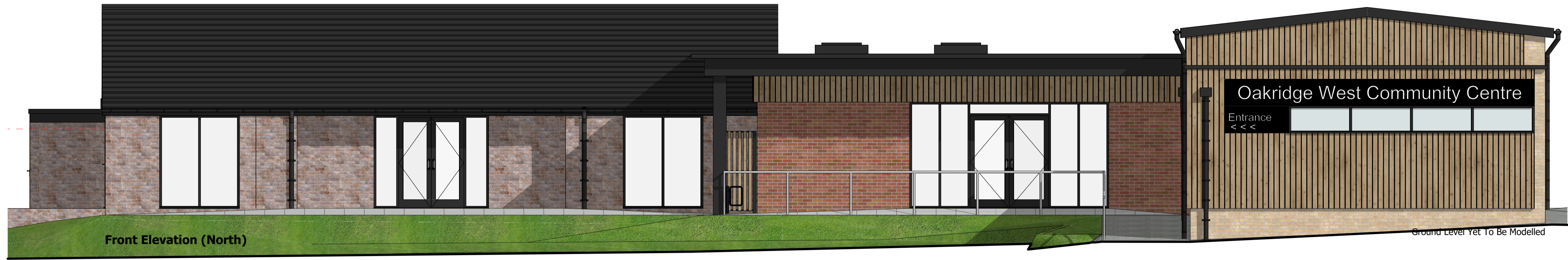
Front Elevation (North)