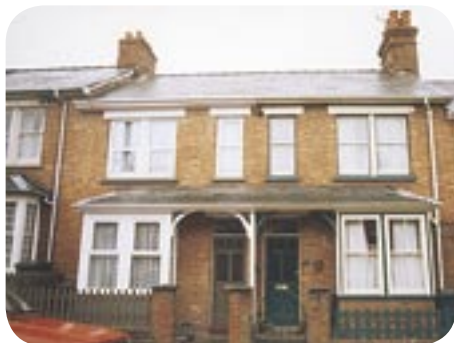
Combined porch and bay roofs, Alexandra Road