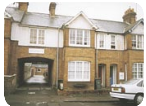
Passageway at Alexandra Road