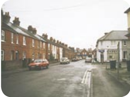
George Street looking east to Queen's Road