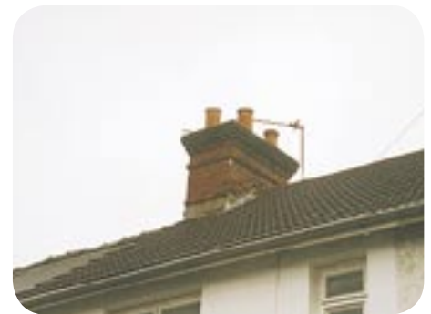
Chimney detail, Alexandra Road