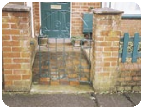
Original quarry tiles, Alexandra Road