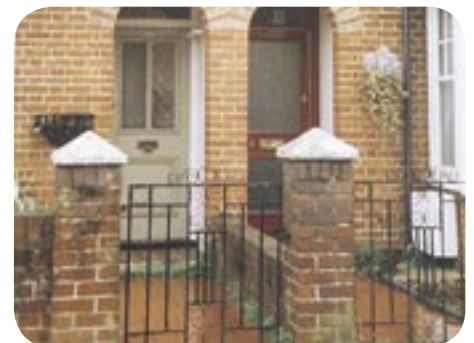
Original door and quarry tiles in Alexandra Road