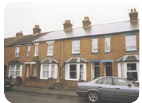
Bay windows in George Street