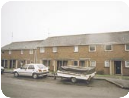
New housing in Lower Brook Street