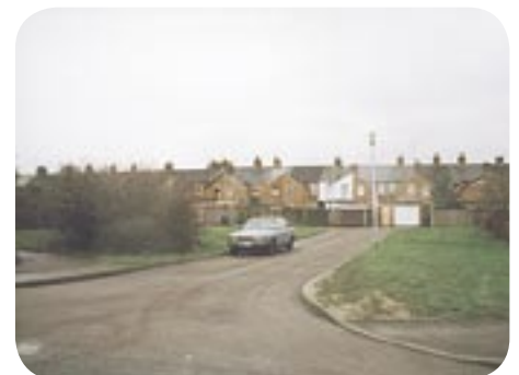
Open space on the south side of Lower Brook Street