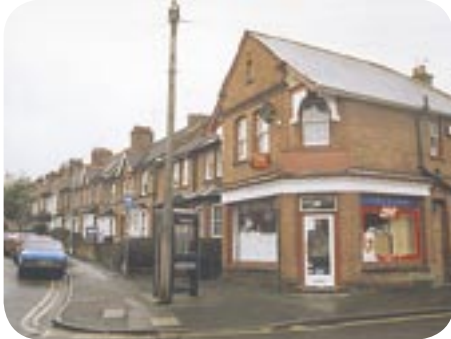
Shop and Post Office, Queen's Road