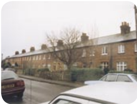
Lower Brook Street