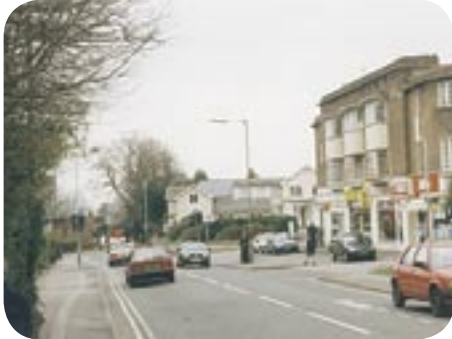
Worthing Road with Downsland Parade and Stowell's funeral parlour