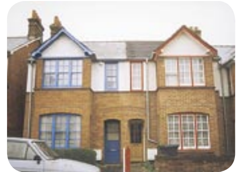
Two-storey bays at Alexandra Road

Much of the original street pattern, its houses and their features, and the integrated mix of commercial and community uses still survives. These provide an appreciable understanding of the cultural and social history of Basingstoke at the beginning of this century. The contribution of these elements as a whole is essential to the special character and historic interest of the area.