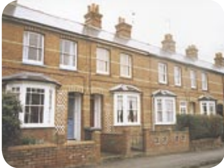
Lower Brook Street