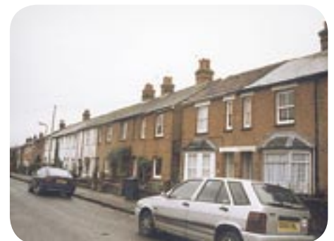
Lower Brook Street