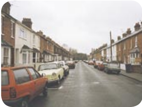
George Street looking west to the King George V playing field