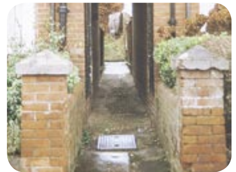
Passageway in Lower Brook Street