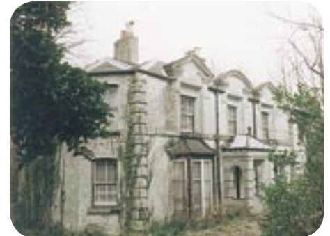
112 Worting Road

The Brookvale West Conservation Area developed as a rectilinear grid of streets between the earlier Brookvale East development and Thornycroft's factory to the west. Constructed between 1897 and 1912, Queen's Road, Alexandra Road, George Street, Deep Lane, Lower Brook Street, College Road and May Street formed the residential area. The southern edge of the area is formed by Worting Road. This is likely to have been an historic route into Basingstoke and is represented on a 1762 map. Thornycroft's factory, constructed in 1898, provided vehicles for military purposes in the First and Second World Wars. As a major employer, its relationship with the development of the area would have been significant. The buildings were demolished in 1991, and a superstore now stands on the site.