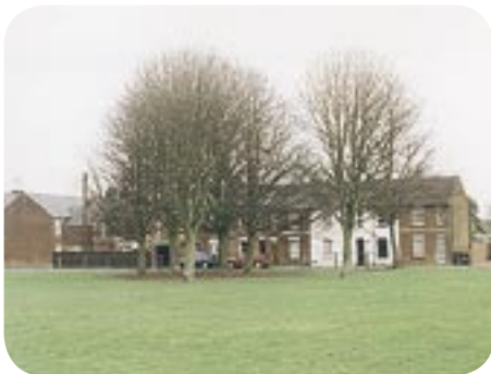
King George V playing field with Deep Lane in the background

The King George V playing field is the only large open space in the Conservation Area. It provides short vistas throughout the west of the area, and along George Street and Lower Brook Street. To the south of Lower Brook Street, part of the original allotment area is now used as a car-parking/communal area. This provides views of the rear of the terraced houses in George Street. Smaller cultivated areas, such as the small front gardens, are just as important. Many of the houses retain the original garden walls and quarry tile pathways, with rope edging.