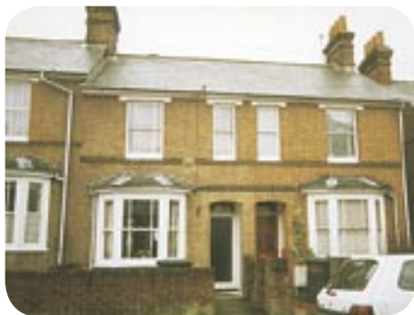
Ground floor bays at Alexandra Road

The type of housing in the Brookvale West Conservation Area is similar to that of many towns and cities of their period. This was a reaction against the slum housing constructed in the factory towns earlier in the 19th century. The 1875 Public Health Act, and the Model by-laws that derived from the Act, set amenity and layout standards, which resulted in minimum street widths and open areas to the rear of dwellings.