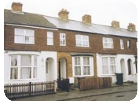
Tile hanging in George Street

112 Worting Road, is an attractive painted brick and slate, classically styled, house in a mature landscape setting. Its rusticated quoins and three pedimented first floor windows give it a distinctive and individual character. The property was restored in 2002, with the addition of a small single-storey side extension and the erection of a new garage on the west side of the house.