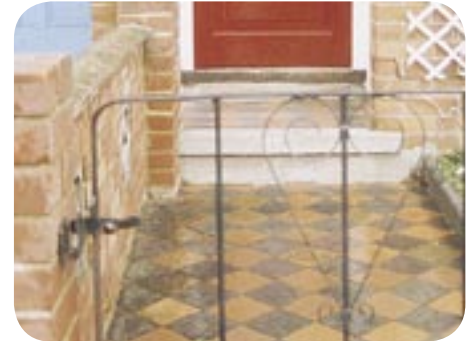
Tiled path in Lower Brook Street

Given the domestic scale and simple provincial architecture of the buildings in the Conservation Area, historic joinery (such as sash windows, doors and door hoods) are often the features that define the appearance of properties. Although some groups of buildings have been modernised, the use and overall effect of inappropriate replacement windows and doors is limited.