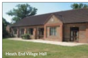
Heath End Village Hall