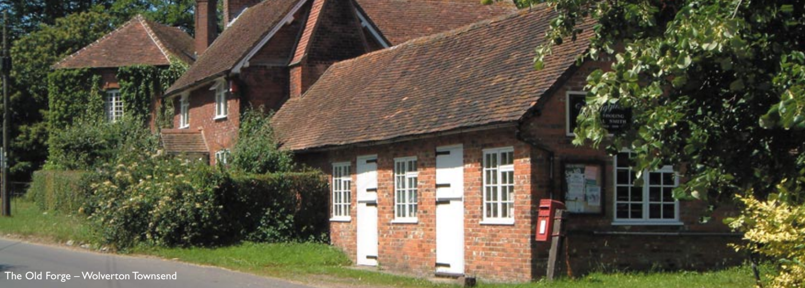
The Old Forge – Wolverton Townsend