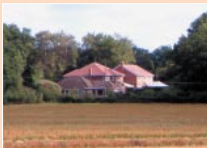
New buildings can have a dramatic effect on rural views – new houses from footpath 11, Violet Lane

The Parish is well wooded, especially on its western side, though interspersed with many small fields having old boundaries, many dating to medieval times and even earlier. Wildlife thrives in this area, notably badgers and deer, as do a wide variety of birds and butterflies, including the magnificent, but rarely seen Purple Emperor. Within the Parish there are large areas of native broad-leaf woodlands, which form and shape the landscape setting. Thin fingers of woodland interconnect these, so providing important wildlife corridors. The northern edge of the Parish, now substantially built on, sustains many conifers on a mainly sand and gravel soil, but as the largely pastoral clay-based landscape in the vale of the Baughurst Brook gives way to the chalk of the Downs in the south, the farmland becomes essentially arable with prairie-like fields. Farming within the Parish is a mixture of livestock and arable, the permanent meadow pastures and grassland leys being mainly grazed by cattle, interspersed with a few sheep - an important part of the pasture management.