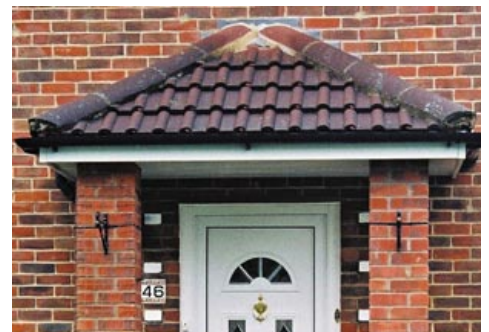
Open porch – 46 Woodlands Road