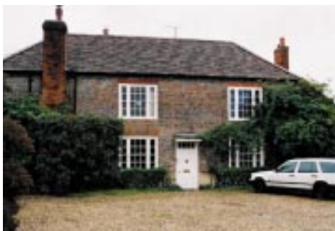
Top hat style porch – Poplar House

Large glass panels and plastics should be avoided. Open porches are preferred, though exposed situations may merit a storm porch.