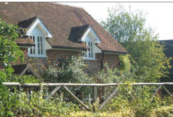
Townsend Cottage, Wolverton Townsend

Hedge and railings mark the original path of Baughurst Road – The Causeway, Church Green