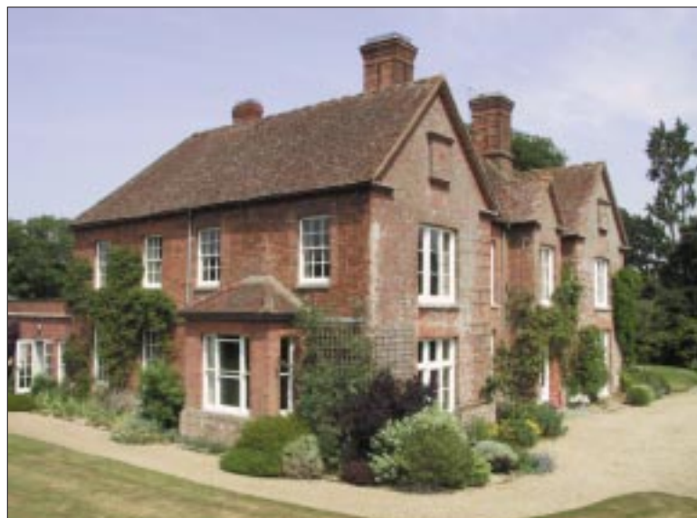
Traditional larger style home which forms part of Baughurst's history – Baughurst House

The Toleration Act of 1689 reduced the importance of Baughurst to the Quakers. Some joined the Anglicans, whilst many joined the Methodists John and Charles Wesley and their friend George Whitfield who lived in Baughurst for some time around 1736.