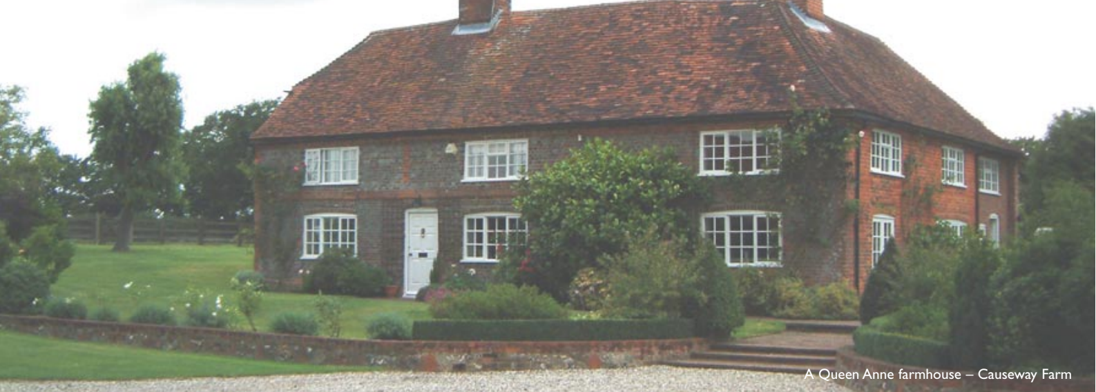
A Queen Anne farmhouse – Causeway Farm