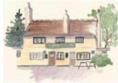
2. Badger's Wood