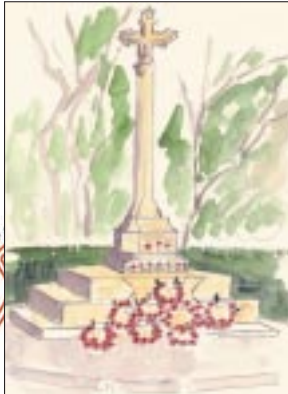
1. War memorial