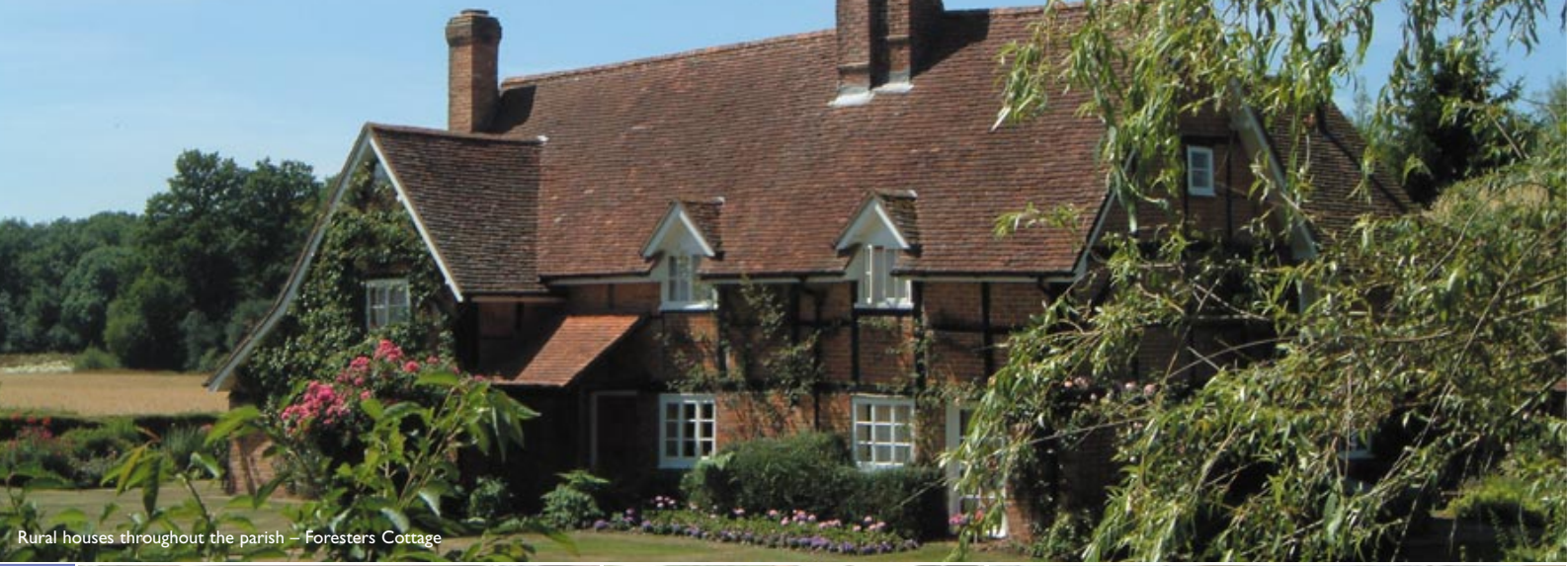
Rural houses throughout the parish – Foresters Cottage