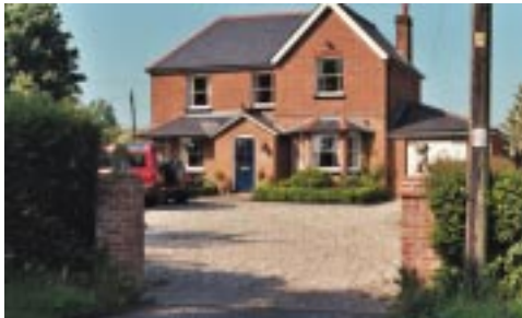
Traditional window size and design – Down View House