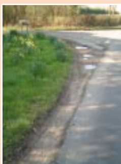
Roadside verges should be repaired and not filled with tarmac – Shaw Lane/ Rimes Lane junction

Many residents express concern about the increase in vehicle speed and size, as well as the sheer volume of traffic that uses the roads and lanes through Baughurst parish. Residents believe many drivers use these roads in order to avoid the busy main routes of the B3051, A339 and A340 and appear to make use of Baughurst Roads as a through-route when travelling to and from locations outside the parish. The straight lengths of roads in the north section of the parish encourage vehicle numbers and speeding.