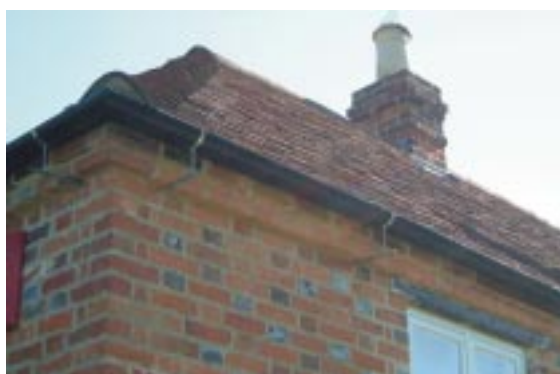
Traditional brickwork detail, no fascia board and traditional rain gutter supports – Loveday Cottage