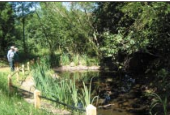
Community project to restore and preserve the Withies – Baughurst Road/Heath End Road junction