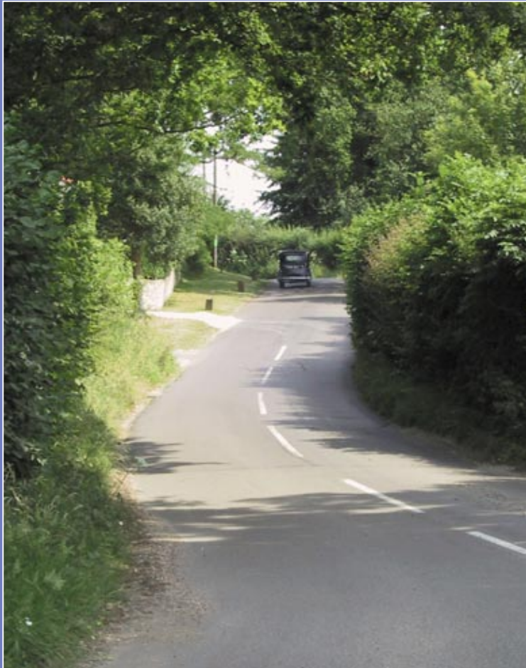
Rural scene, Church Lane, Baughurst – Summer 2004