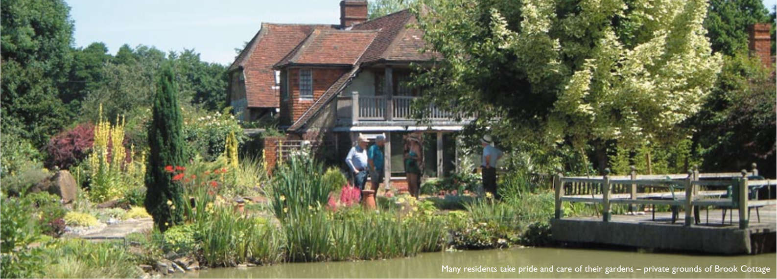
Many residents take pride and care of their gardens – private grounds of Brook Cottage