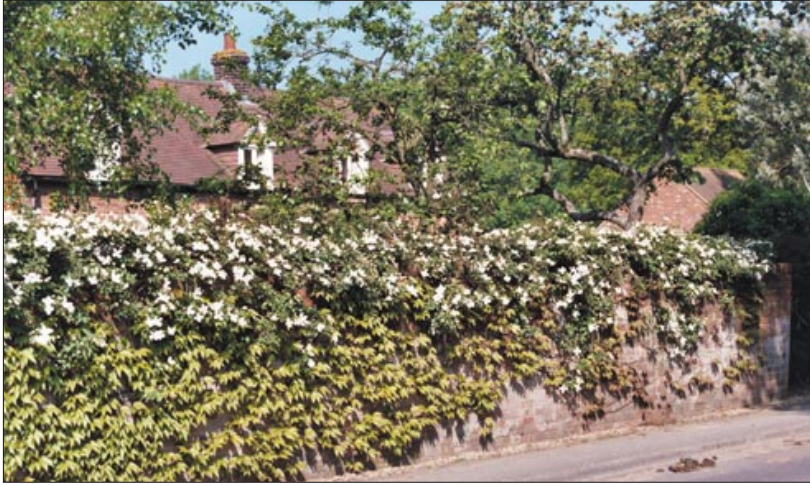
High brick wall with plain top is softened with the use of foliage – Baughurst Road

The Old School House at Church Green has recently erected a long boundary wall constructed from reclaimed bricks. Properties in the Parish mostly make use of native tree species and shrubs for boundaries: Baughurst House and The Merse have good examples of impressive hedge boundaries. Whilst accepting the need for boundaries, the character of the village is enhanced if properties with exceptional character and charm are not completely hidden away.