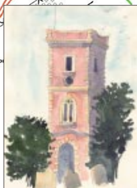
7. Wolverton church