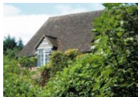
Adding character, small dormers in newer houses follow local tradition – The Merse