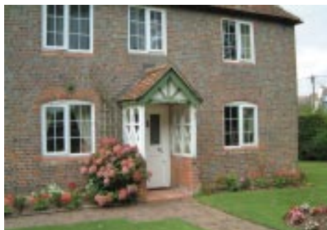
Open porch – Upper Farm