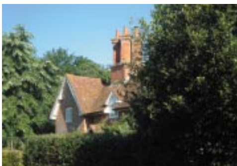
Chimneys are an important feature

Chimneys built within the core of a home are preferred to those placed on an external wall. Stainless steel pots should not be used.