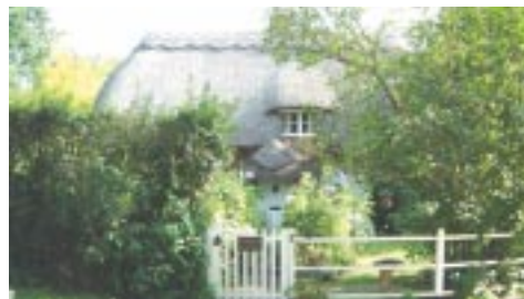
Retain thatched roofs – Snowdrop Cottage