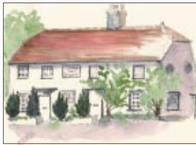
6. George & Dragon