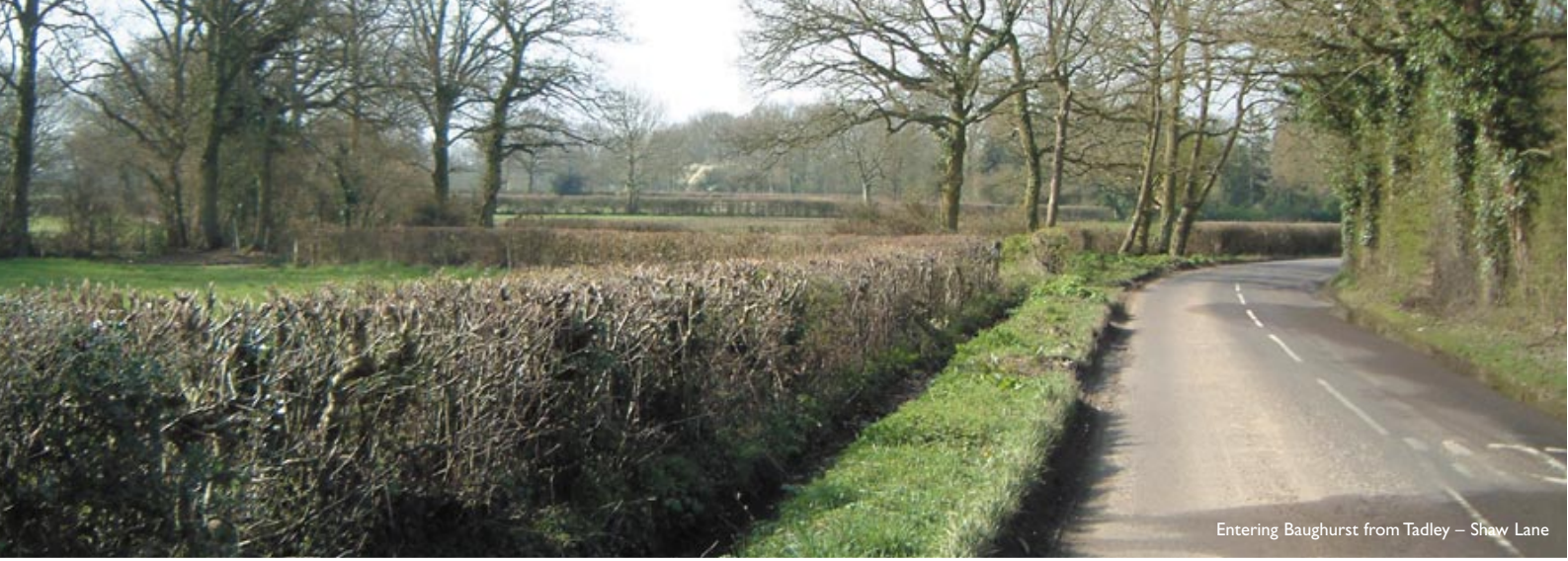
Entering Baughurst from Tadley – Shaw Lane