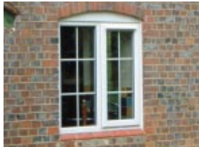
Original style window ledge retained – Upper Farm