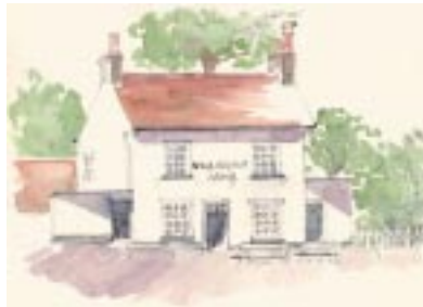
4. Wellington Arms