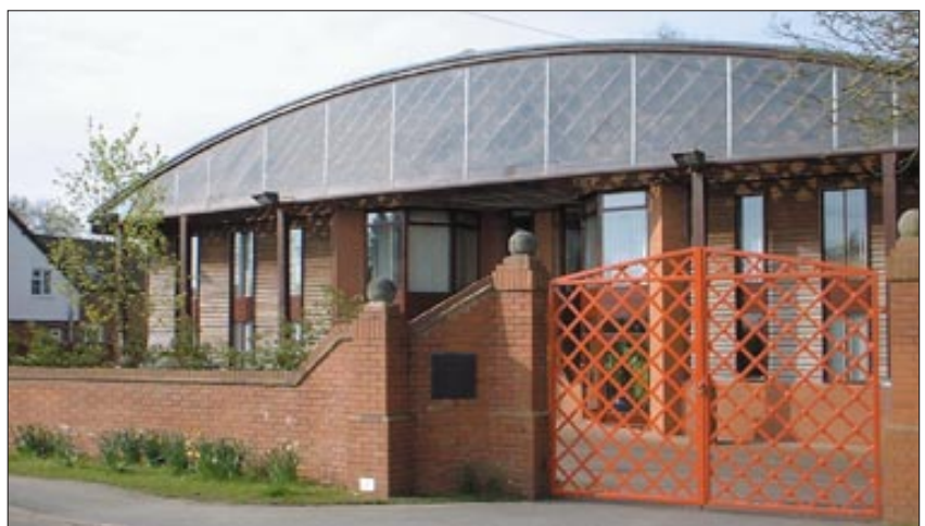
Architectural merit of the single span timber roof – Lattice House

Originally built in the 1930s as a bus depot, this building boasted the largest timber single-span roof structure in the south of England. However, with the decline of local bus services, the building became redundant. Albeit the building stands rather high compared to its surroundings, it is acceptable because of its architectural merit. It has been sympathetically modernised and provides office and work space for a local firm. The roof structure (which is listed) has been retained. The structure and design blends well and does not have any large area of glass frontage. The low front boundary wall allows a good view of this important building.