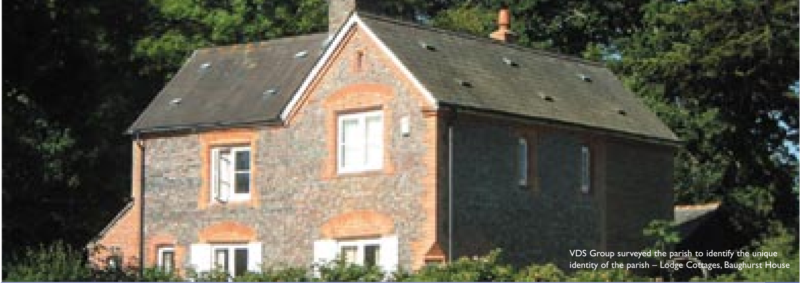
VDS Group surveyed the parish to identify the unique identity of the parish – Lodge Cottages, Baughurst House