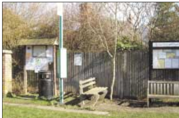
Stoke notice boards

67% of respondents thought the notice boards by the Village Shop were good, with 32% rating them reasonable and 1% rating them poor.