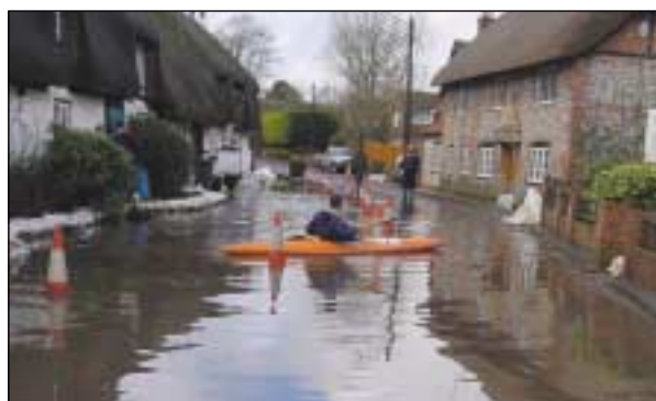
Flooding in January 2003