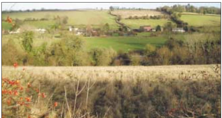
Gangbridge Lane from the Test Way

Most of us who live in the parish of St Mary Bourne believe that we are most fortunate to be in a "real" village environment where newcomers are made very welcome by those who have been living here for a long time, perhaps for generations.