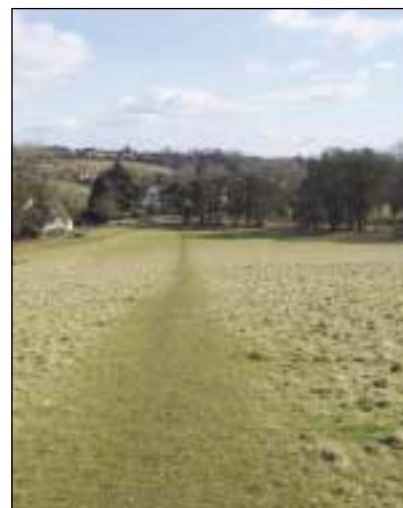
Test Way approaching St Mary Bourne

The river, lake, trees, shrubs, woodland and open spaces within the parish are key features which are valued by residents and visitors. Rights of Way (including the Test Way) enable access to the many views over the valley for walkers and riders.