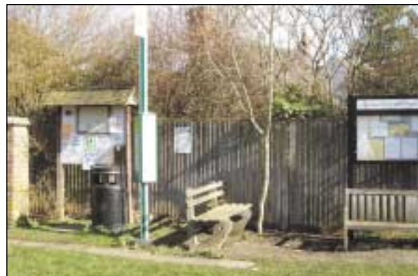
Stoke notice boards

67% of respondents thought the notice boards by the Village Shop were good, with 32% rating them reasonable and 1% rating them poor.