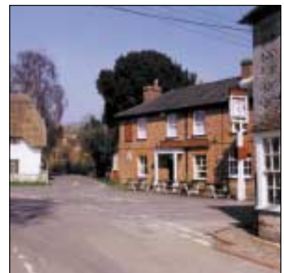
The George Inn

function rooms of varying kinds. The Bourne Valley Inn also has 10 bedrooms to let and the Wyke Down Country Pub runs a caravan site, a golf driving range and intends to add a 20 room hotel block to the site.