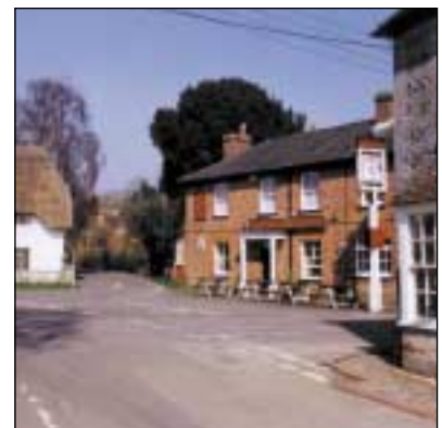
The George Inn

function rooms of varying kinds. The Bourne Valley Inn also has 10 bedrooms to let and the Wyke Down Country Pub runs a caravan site, a golf driving range and intends to add a 20 room hotel block to the site.