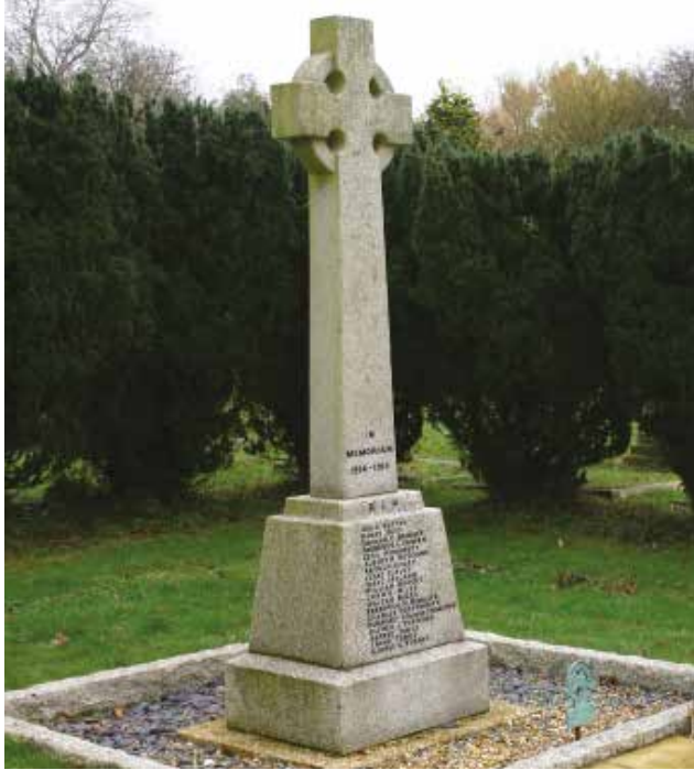
Sherborne St John