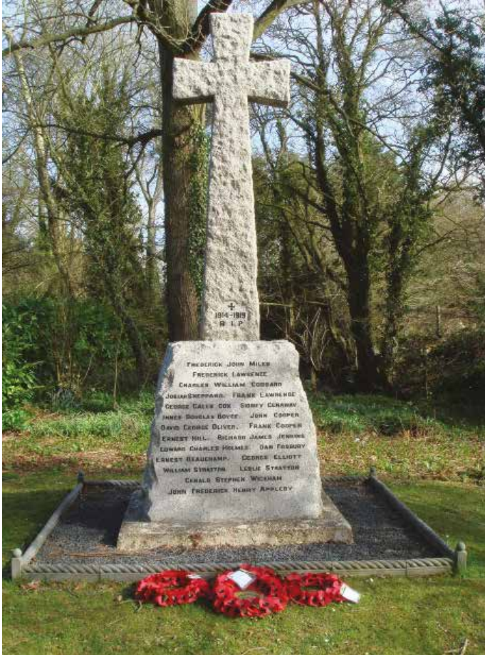
Ecchinswell, Sydmonton and Bishops Green