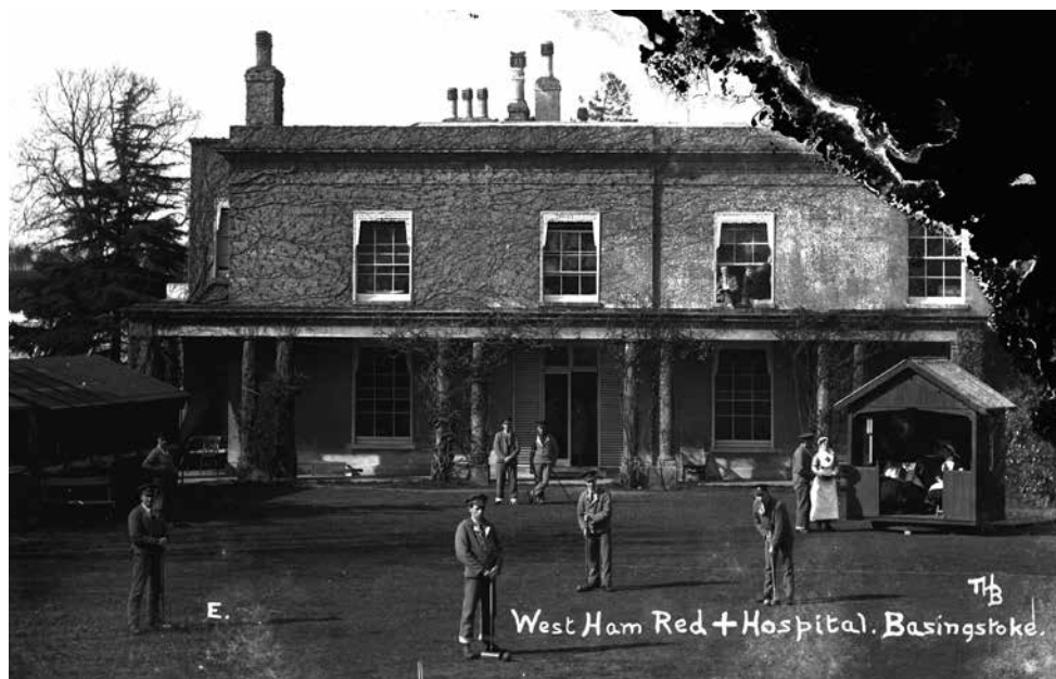
Archive photograph of patients playing croquet in hospital grounds of West Ham Red Cross Hospital