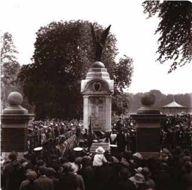
Archive photograph of the unveiling of Basingstoke War Memorial in 1923

The War Memorial purchased for the people of Basingstoke in 1923 has remained unmoved since it was first placed outside the War Memorial Park.