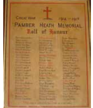
Pamber Heath Memorial