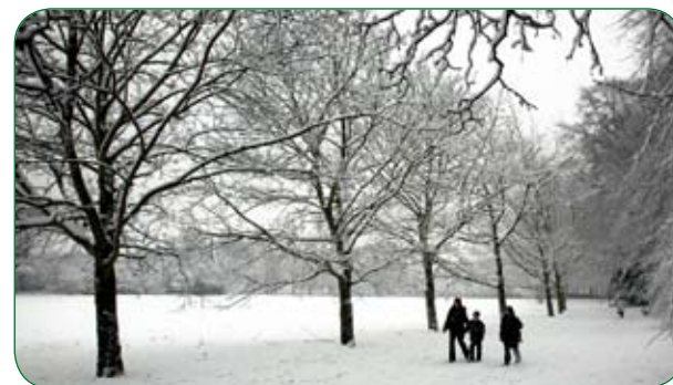
Above; © Photography by Jo Andreae, One World One Camera