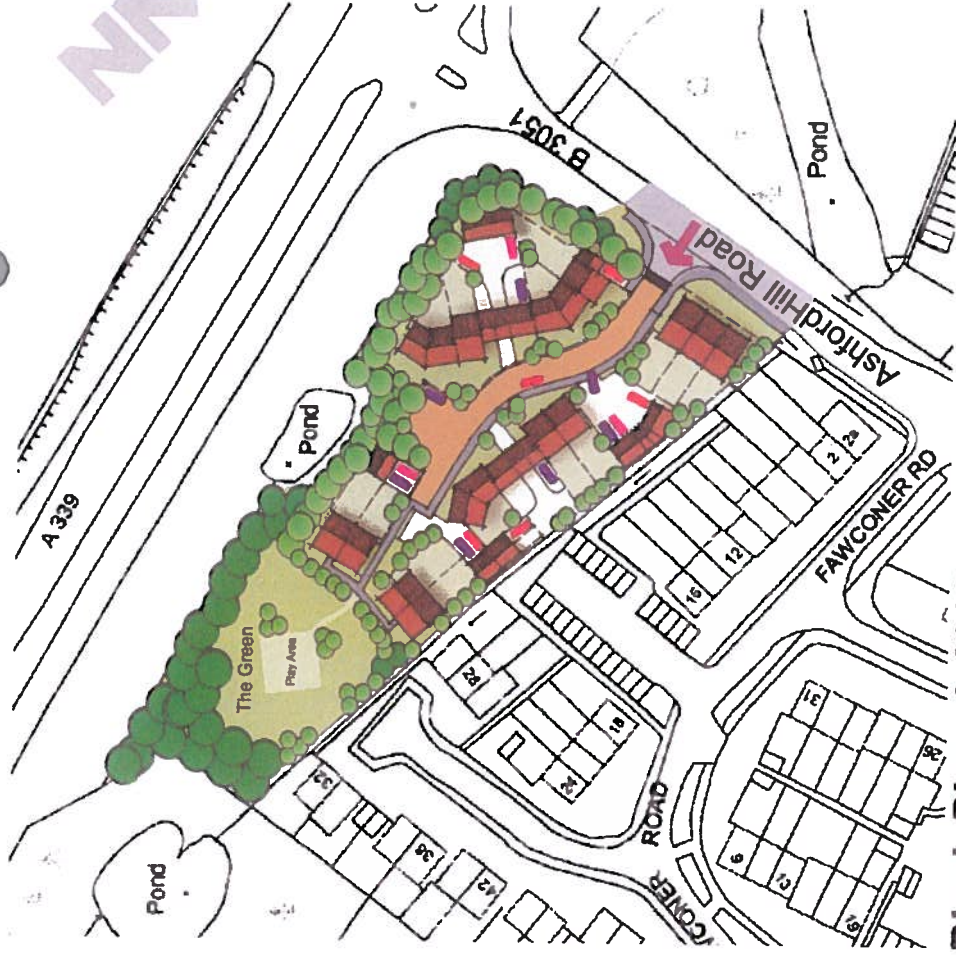
Block Plan 1:1000

Site Area 0.587 ha Density 32 / ha Affordable Housing 30 % Public Open Space 0.126 ha